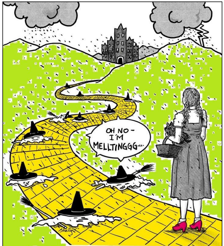
The little known origin of autocross