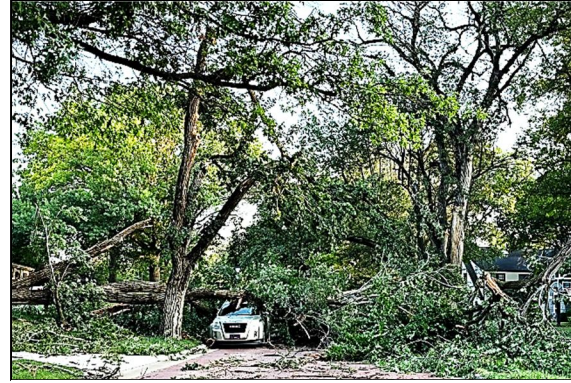
Storm damage City of Salina had to deal with.

It took a while, but we finally got the final round of the Sunflower Solo Showdown in the books. Originally scheduled for Aug. 11, two weeks after the LeadSled Spectacular custom car drags, that date has always worked before. But the July 31 windstorm, which recorded 95 mph winds in parts of the city, meant city crews which normally would have taken care of removing the jersey barriers lining the BFRA pavement were tasked with removing trees and branches throughout the city – almost 5,000 tons of storm debris, a job which took almost four weeks. Removing the barriers from our playground was understandably a lesser priority.