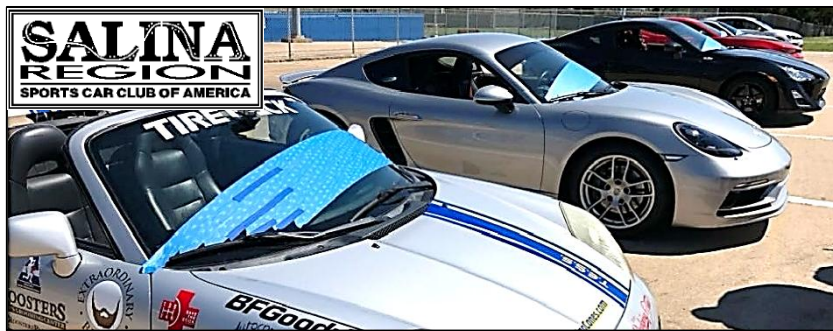
Evolution School (2025), Challenge School cars with half of windshield blocked off ("Look ahead" lesson)

The official newsletter of the Salina Region SCCA