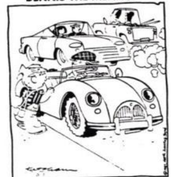
DENNIS THE MENACE

"THAT'S CUTE. WHAT KIND OF CAR WILL IT BE WHEN IT GROWS UP?"